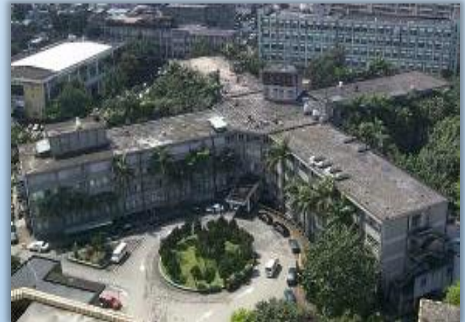
Tingzhou Rd. in 1968