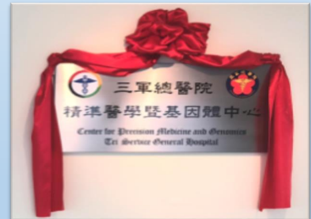
The center for precision medicine (PM) and genomics was set up