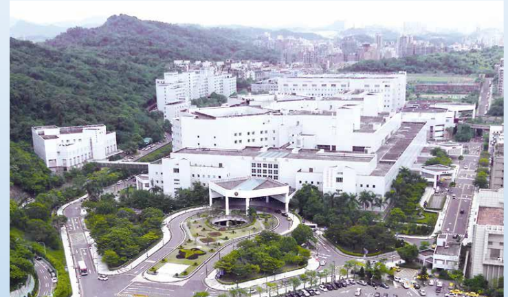
The current site of the National Defense Medical Center in Neihu (2000)

With Care, Quality, Discipline and Innovation as our core values, constant provision of teaching, studies and services will always be our goals, the Tri-Service General Hospital (TSGH) hopefully is one of the top medical institutions in Taiwan. As it comes to medical services, TSGH will continue cooperate with foreign and domestic medical and research facilities and faculties. With a new look and edgy healthcare dedicated to the armed forces and the public, and as a paradigm of all military hospitals, it is our vision to be the top hospital nationwide, and the healthcare guardian in the community and international medical center worldwide.