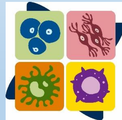
The cell therapy center provides total cancer therapy.