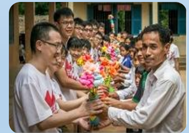
國際醫療援助及交流 International healthcare support and exchanges