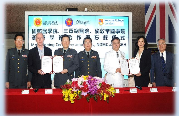
The MOU for academic cooperation signed with The Imperial College of Science, Technology and Medicine in London, UK

We have set up the international healthcare center with annual task. International healthcare support, drills, clinical training for foreign medical personnel and students, various international academic campaigns (symposiums and seminars, workshops and lectures sessions) are prepared and deliberated on schedule. This fully proves proactive engagement and investment in international healthcare and sanitation.