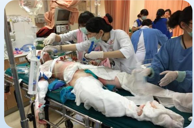
TSGH received the most of the Formosa Fun Coast dust explosion victims with no mortality.

It is our anticipation to gradually improve the quality of medical services and the operating capacities provided to the army, the dependents and the public with software and hardware updated constantly.