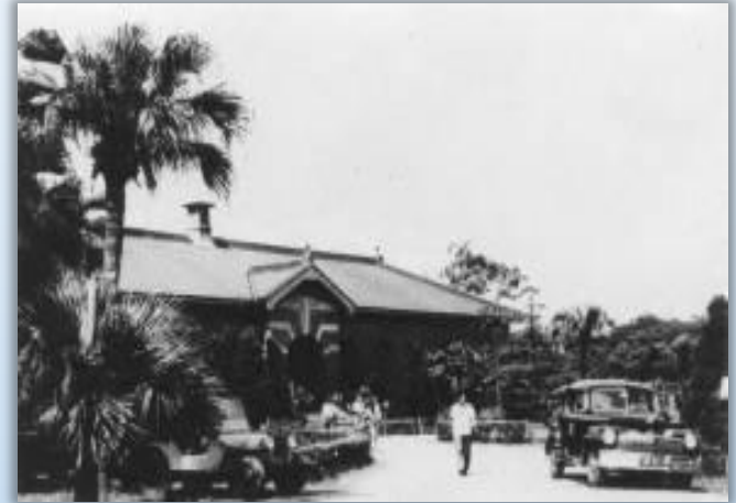
Guangzhou St. in 1946

Tri-Service General Hospital (TSGH), originally named as the Army 801 General Hospital, was founded in 1946, and reorganized and renamed in July, 1967, after moving from Guangzhou St. to Tingzhou Rd. (a.k.a. the water source camp). To cope with rapidly changing medical settings and strive for the overall development of medical education for the armed forces, the National Defense Medical Center (NDMC) was set up by combining the National Defense Medical College and TSGH in November, 2000 at Neihu, Taipei, where the complex ranged approximately 43 hectares, while outpatient and emergency services are still available in the original Tingzhou Branch. Following the national policy, the Navy hospitals in Penghu(811) and Keelung(812), the Songshan Airforce hospital(807), Beitou hospital(818) and the Taipei Outpatient Center are all affiliated to TSGH, serving military personnel and civilian with top quality medical services. A new page for the medical services provided by the armed forces nationwide was unfolded.