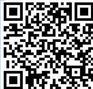
FB fan page